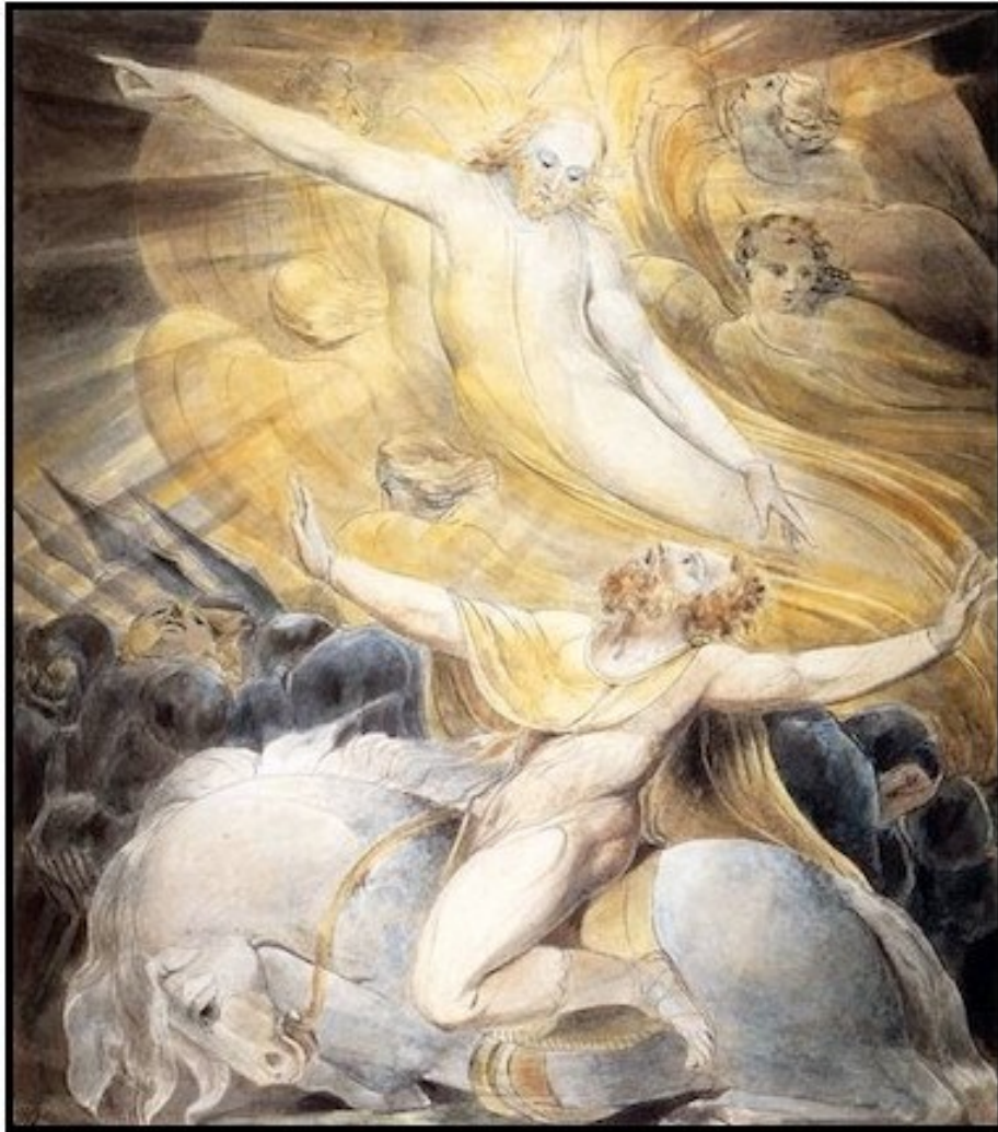
“Conversion of Saul” William Blake, 1800

The Episcopal Diocese of Massachusetts now requires congregants maintain physical distancing (6 ft. or more) between households at all gatherings and that masks be worn by everyone (except children aged 2 and under) at all indoor gatherings.