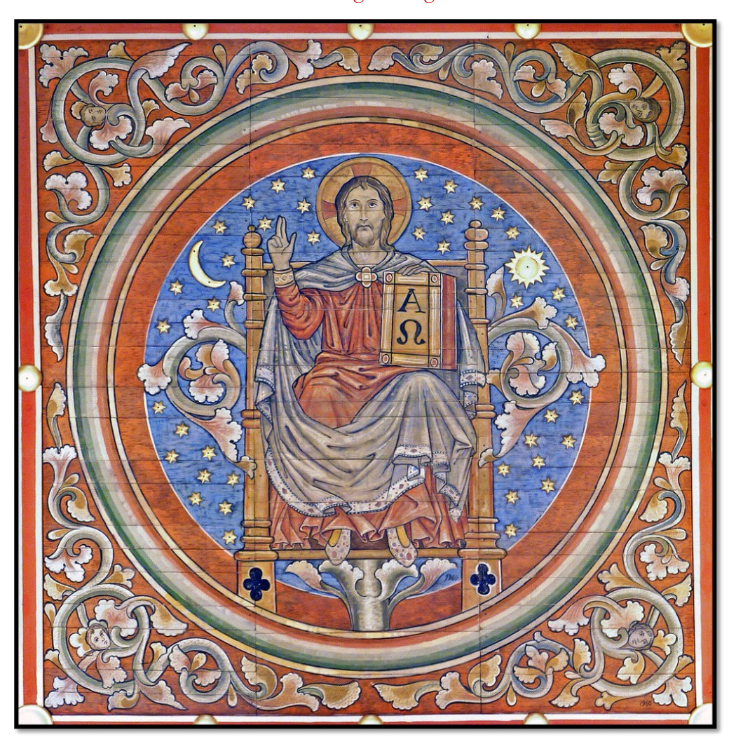
"Tree of Jesse, Christ Enthroned" Anonymous, 1230

The Episcopal Diocese of Massachusetts now requires congregants maintain physical distancing (6 ft. or more) between households at all gatherings and that masks be worn by everyone (except children aged 2 and under) at all indoor gatherings.